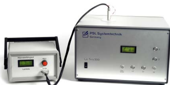
Lambda with LabTemp 300 - for high temperatures

Due to the very high speed of the thermoelectric heating/cooling and the extreme temperature homogeneity of the LabTemp 30190 short measuring times are achieved, thereby the measuring frequency is increased significantly. Only small volumes of sample (approx. 45 ml) are sufficient to execute reliable measurements.