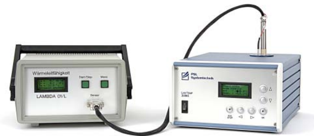
Measuring System Lambda with LabTemp 30190